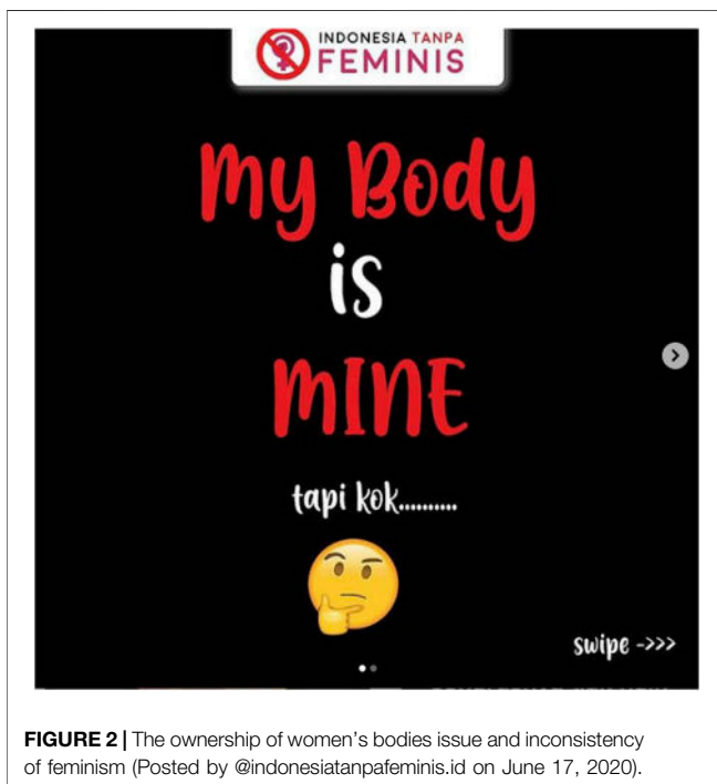
FIGURE 2 | The ownership of women's bodies issue and inconsistency of feminism (Posted by @indonesiatanpafeminis.id on June 17, 2020).