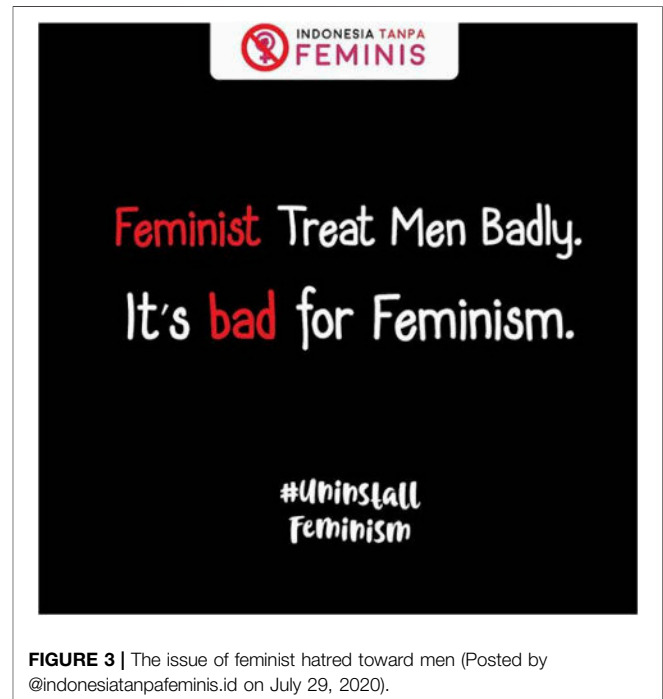
FIGURE 3 | The issue of feminist hatred toward men (Posted by @indonesiatanpafeminis.id on July 29, 2020).

that it forces women to do the same things regardless of women's physical limitations.